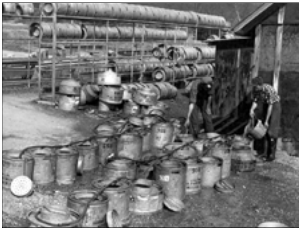
Ozark Fisheries staff loading goldfish into custom containers which allowed their fish to be shipped by rail car.