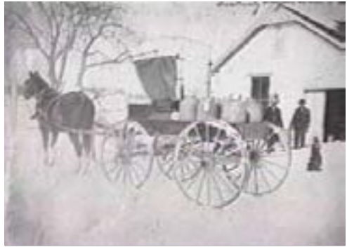
Workers loading containers of fish at Neosho National Fish Hatchery.

In Missouri, aquaculture originated with the State Fish Commission and the Federal government. The State built their first fish hatchery at Brown Spring near St. Joseph and the Federal government developed the Neosho hatchery in 1888. Attempts at commercial aquaculture soon followed and continue today.